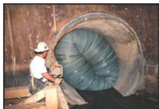
Inserted liner for repair