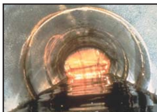
Old / Corroded Pipe

Rhino™ 1310T-Lt Blue CIPP employs a fast curing agent allowing less invasive replacement procedures to be completed on time and within budget. Rhino™ 1310T-Lt Blue is the ideal solution for rehabilitation of municipal, industrial and residential pipes.