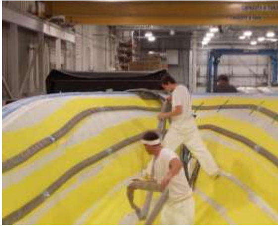
Resin infusion lines are added to yellow flow media.