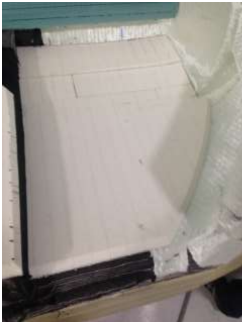
Closeup of fiberglass and foam core laminate layers.