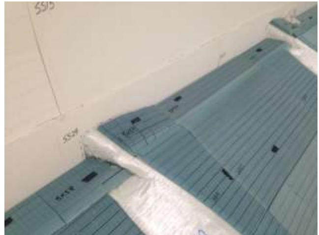
Closeup of green foam core adjacent to white fiberglass plies in a contoured section of the stepped hull.