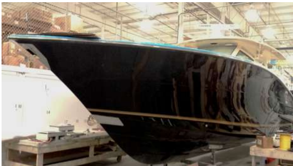
Black-hulled 420 LXF before final finishing.