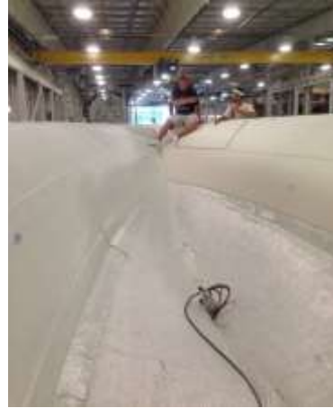
Workers prepare to spray adhesive over the completed sandwich construction before adding flow media and the vacuum bag.