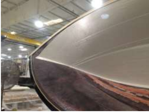
Skin coat is shown at the bottom with the first layer of fabric at the top.

filings with the U.S. Securities and Exchange Commission. Significant risks and uncertainties may relate to, but are not limited to, financial, economic, competitive, environmental, political, legal, regulatory and technological factors. The company assumes no obligation to provide revisions to any forward-looking statements should circumstances change, except as otherwise required by applicable laws.